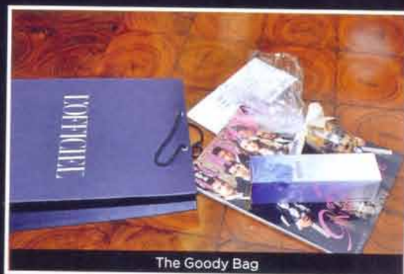
The Goody Bag